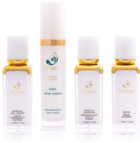
moana intensive dry skin solution collection