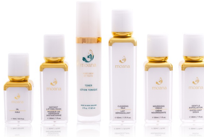
moana anti-ageing solution collection