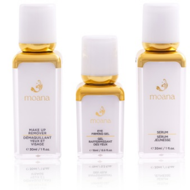
moana advanced eye care collection