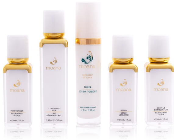
moana oily skin solution collection