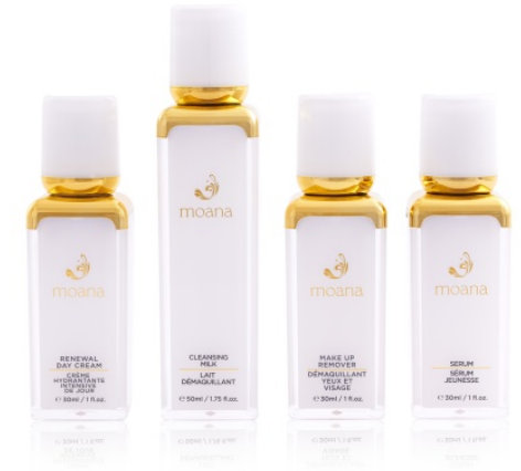
moana normal skin solution collection