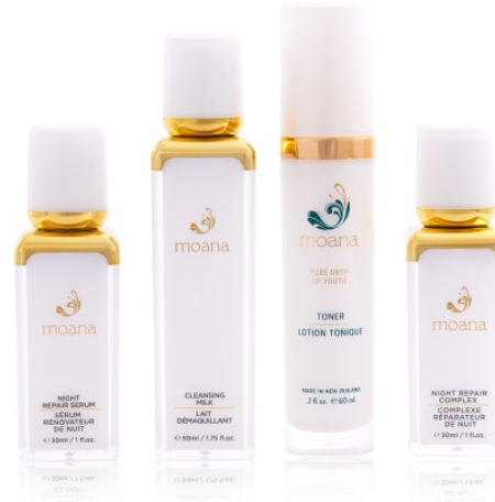
moana ultimate night care collection